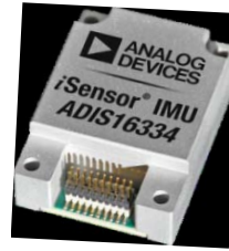
Figure 1. Six Degrees of Freedom Motion Detection in an 11 mm × 22 mm × 33 mm Package

For example, the Analog Devices ADIS16334 iSensor IMU has the integration and performance necessary for most industrial navigation problems in a compact format that is amenable to many industrial instruments and vehicles (see Figure 1). In many cases, four or more additional degrees of freedom can also be integrated, including three axes of magnetic sensing and one axis of pressure (altitude) sensing.