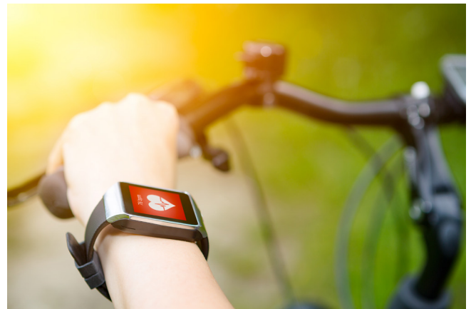
Figure 1. Smart Watch

Until recently the primary focus for voltage regulation design has been the efficiency of power delivery in active mode, from light to peak to full load. Business is routinely won and lost over a fraction of a percent of efficiency advantage. With the efficiency curve well understood and opportunities for improvement reaching saturation the focus is shifting to optimizing the power savings in passive mode. Passive mode