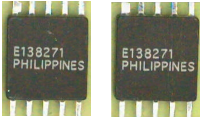
Bottom Brand Ink Mark