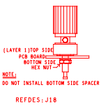
BINDING POST ASSEMBLY