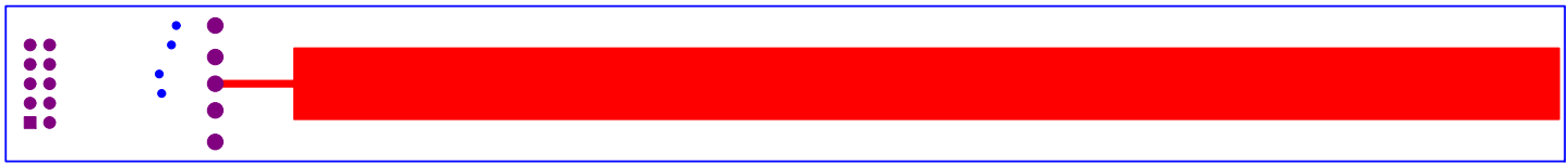
AD7746 Level Demo PCB Rev. C – Component Side View.