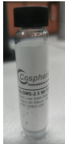
Cospheric Glass Sphere Packaging: 10g/ Glass Tube