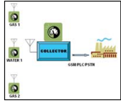
Figure 1 – Multi-metering topology

applications. The advantage of using the electricity meter as the concentrator node lies in its access to mains power as well as the head start electricity meter companies have in implementing AMR systems.