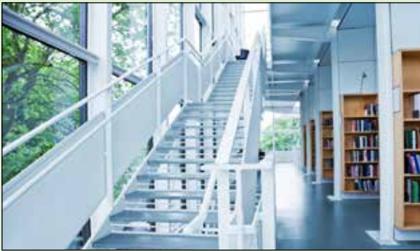
Smart Building: temperature, humidity, PIR, CO 2 , and vibration detection; lighting, ventilation, and alarm control