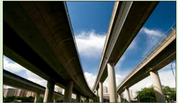
Infrastructure Monitoring: vehicle and collision detection; lighting and video surveillance control