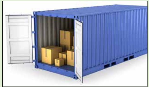
Asset Tracking: barcode, temperature, humidity, and vibration detection; barcode tracking