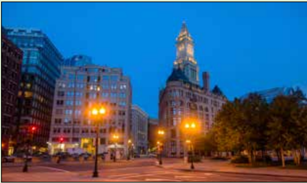
Street Lighting: vehicle and passenger detection; lighting control